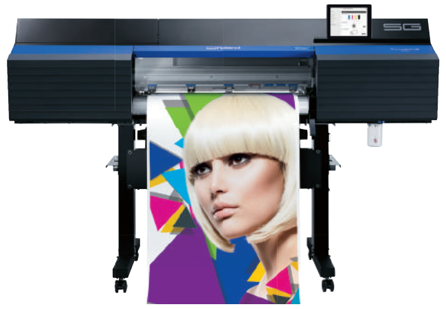
SG-300 (762 mm wide)