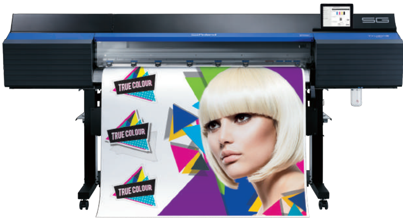
SG-540 (1,371 mm wide)